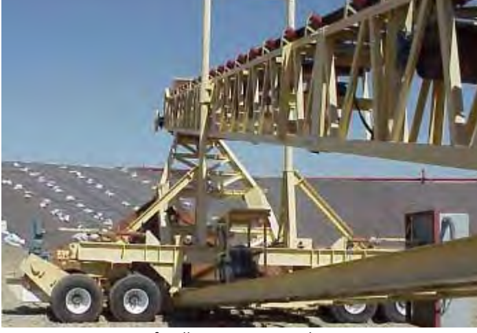
Al Hajar open pit